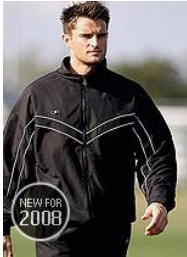
LUNAR JACKET- Black-White